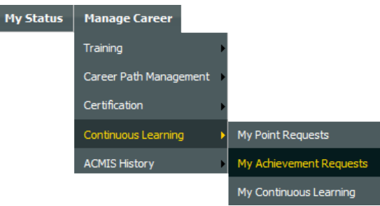
Figure 1: My Achievement Requests

1. From the main navigation bar, go to Manage Career | Continuous Learning and click My Achievement Requests.