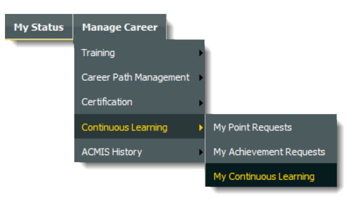
Figure 1: My Continuous Learning

1. From the main navigation bar, go to Manage Career | Continuous Learning and click My Continuous Learning.