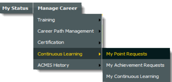
Figure 1: My Point Requests

1. From the main navigation bar, go to Manage Career | Continuous Learning and click My Point Requests.