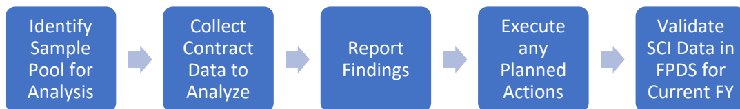
Figure 1: Analysis Process

To ensure the Department sufficiently addressed the service contract inventory requirements and developed a meaningful Analysis Report, a working group was utilized consisting of representatives from DOC's contracting offices. As a result of the collaborative effort of the working group, a repeatable process, as depicted in Figure 1, was established to comply with the annual service contract inventory requirements.