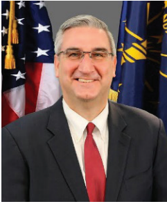
Eric J. Holcomb Governor of Indiana

Eric Holcomb is the 51st Governor of Indiana. Governor Holcomb is a veteran of the United States Navy, served as the state's 51st Lt. Governor, was a trusted advisor to both Governor Mitch Daniels and Senator Dan Coats, and was a former state chairman of the Indiana Republican Party.