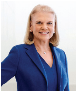
Virginia M. (Ginni) Rometty Chairman, President and Chief Executive Officer IBM

Her top priorities as governor are creating good-paying jobs, cutting taxes, investing in public schools and increasing opportunity in every part of Iowa.