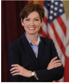
Kim Reynolds Governor of Iowa

Kim Reynolds is the 43rd Governor of Iowa. Reynolds understands the challenges families face because she's faced them herself. A fifth-generation Iowan, she grew up in a working-class family in St. Charles, Iowa. A recognized leader in state and local issues, Kim served as county treasurer and state senator before becoming Lieutenant Governor and Governor.