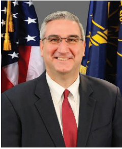
Eric J. Holcomb Governor of Indiana

Eric Holcomb is the 51st Governor of Indiana. Governor Holcomb is a veteran of the United States Navy, served as the state's 51st Lt. Governor, was a trusted advisor to both Governor Mitch Daniels and Senator Dan Coats, and was a former state chairman of the Indiana Republican Party.