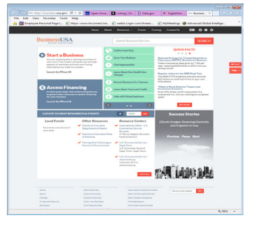
Figure 2 - BusinessUSA Services

Over the last several years, the government has spoken with thousands of business owners to hear what works and what doesn't when dealing with the federal government. Entrepreneurs, especially small business owners have indicated that navigating the complex maze of government agencies was reducing production and resources and requested a one stop shop solution to obtain the assistance needed throughout every stage of business development.