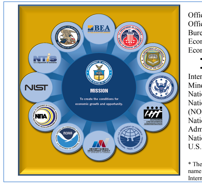
Figure 1 - Commerce Bureaus and Operating Units (BOU)

T he Department carries out its programmatic responsibilities through its 12 BOUs identified below in "Figure 1."