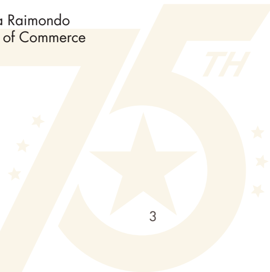
Secretary Gina Raimondo U.S. Secretary of Commerce

A handwritten signature in cursive script that reads "Gina Raimondo".